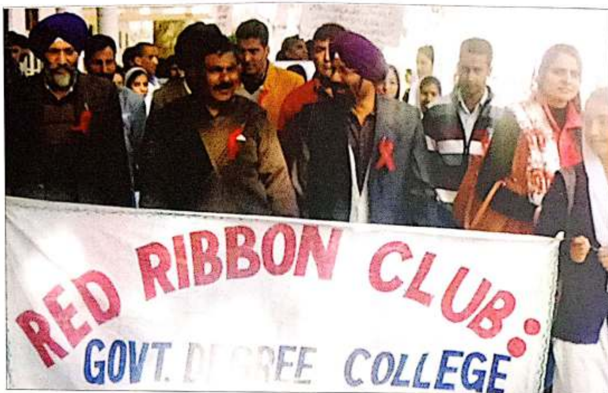
Rally of Red Ribbon Club