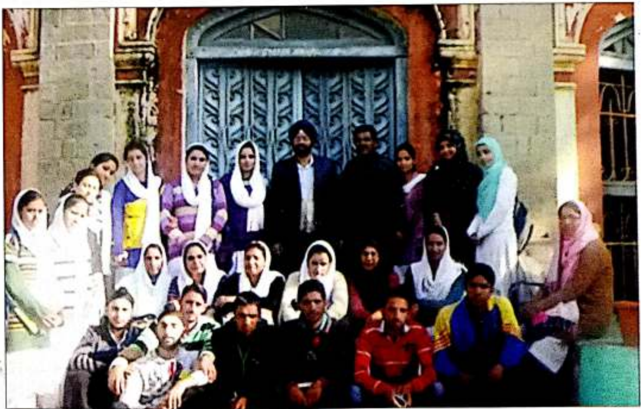
Students visit to Historical Monument "Sheesh Mehal"