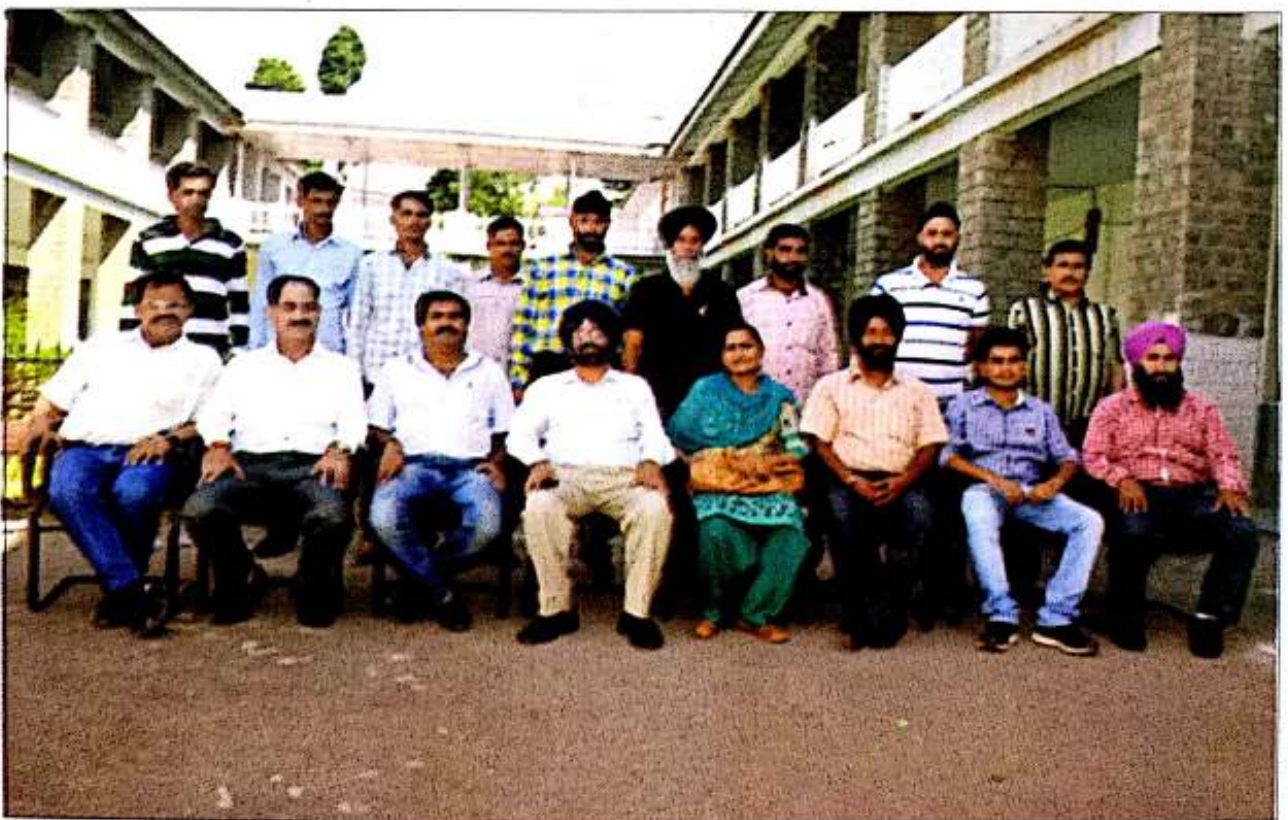
Non-Teaching Staff of the College