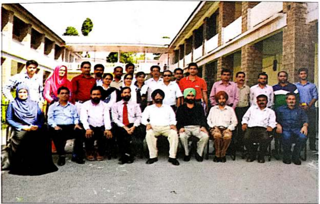
Teaching Staff of the College