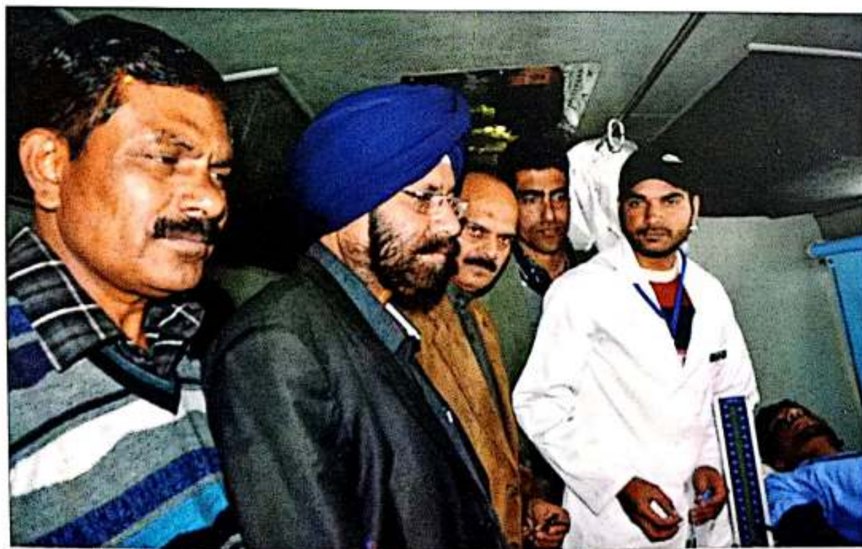
Blood Donation Day